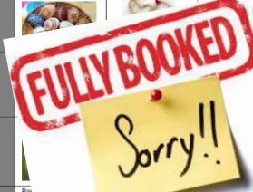
Easter at Club Caldecote Monday 12 th – Friday 16 th April 2021